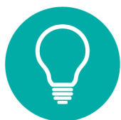
Innovation & co-design