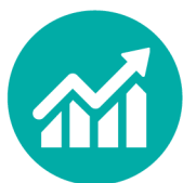
Evaluation & impact