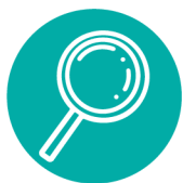
Research & analysis

We support organisations, commissioners and governments to explore emerging challenges, evaluate practice, generate evidence and develop innovative solutions that improve employability outcomes.